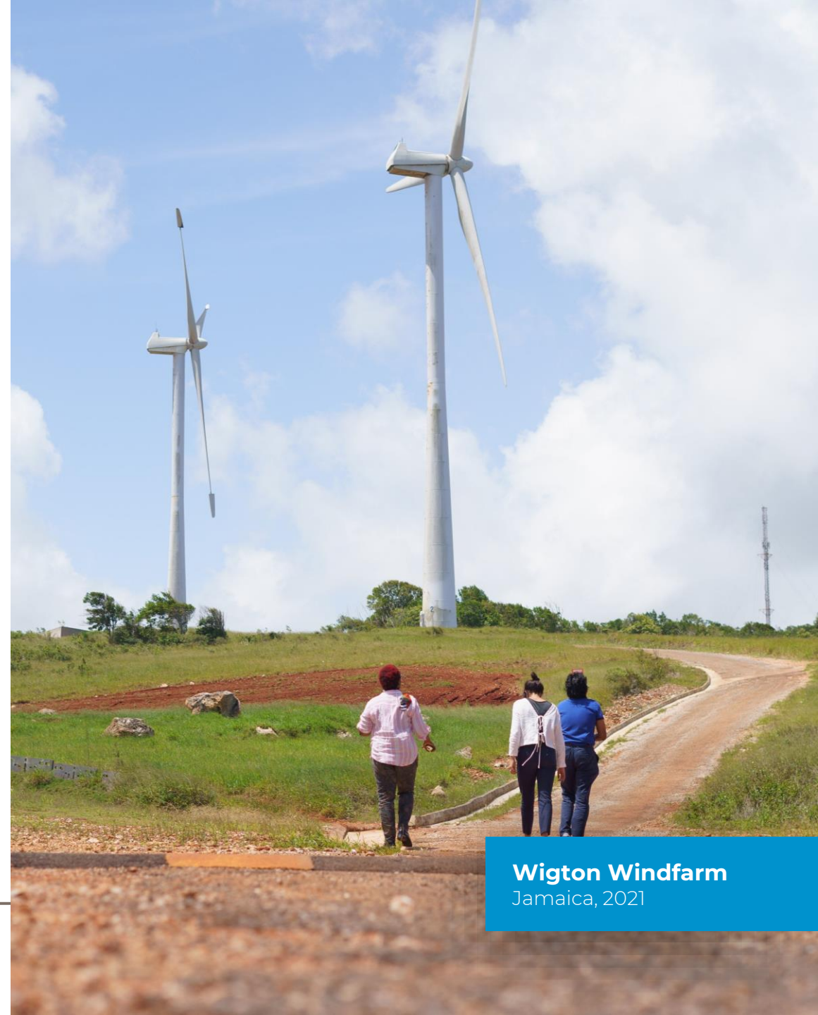
Wigton Windfarm Jamaica, 2021

Based on these requests, the membership offers a tailored package of expertise, technical assistance, and funding.