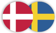
Denmark / Sweden