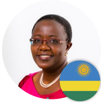
Minister Jeanne d'Arc Mujawamariya Rwanda