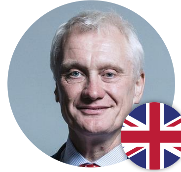
Minister Graham Stuart United Kingdom